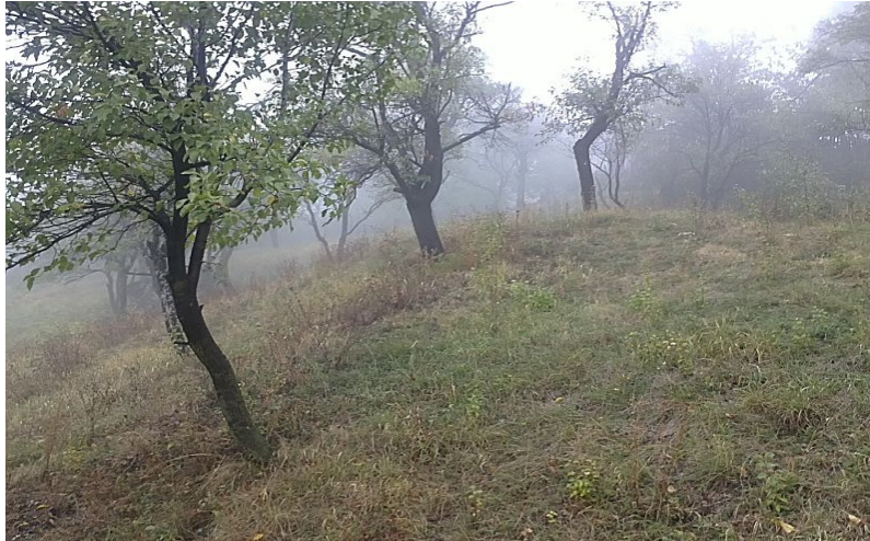
Picture 5 Landslide accumulation zone