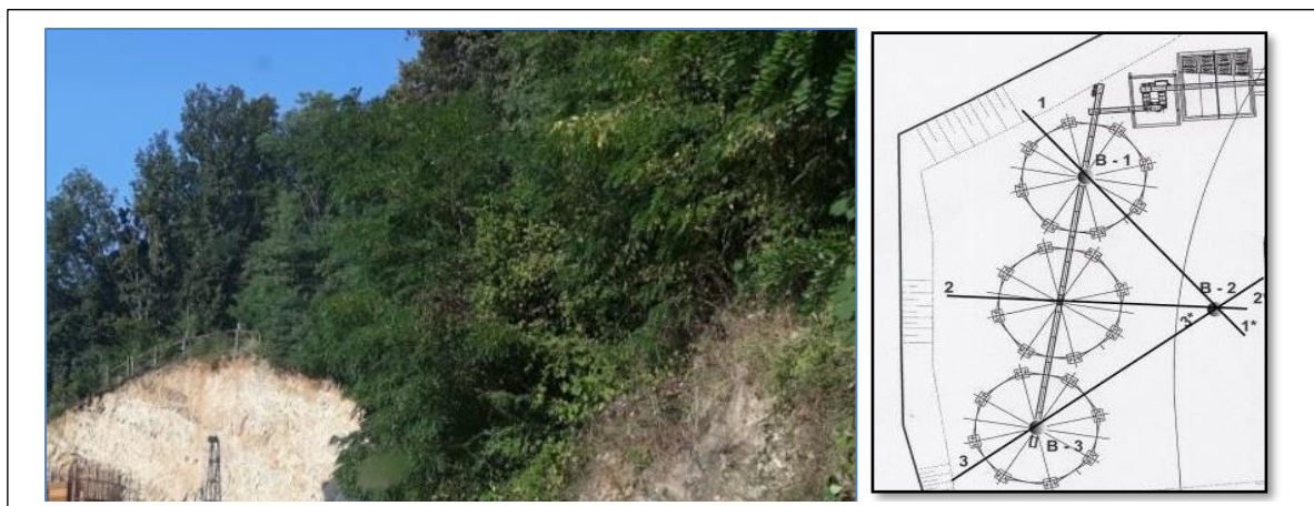
Figure 1. Open cut slope profile with silos at the base

During the drilling process, attention was focused on the quality of the core in order to see the natural state of the massif as realistically as possible. Detailed mapping of the core of the inflated material was carried out and samples were taken from the characteristic layers. Along with monitoring of the presence of underground water in the borehole, the behavior of marls was monitored from the time of the extraction from the rock massif to the time of their decomposition on the surface of the terrain.