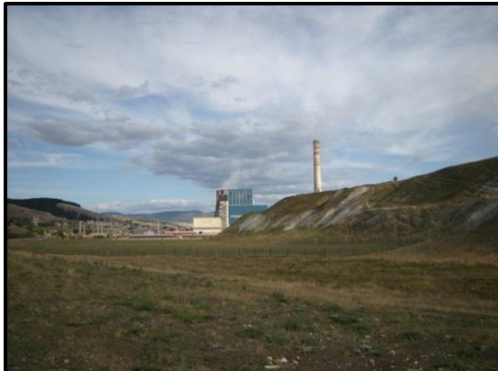
Figure 3. Power plant Gacko and dumps in the process of recultivation [14]

The values of natural radionuclides ^{210}\text{Pb} in slag in USA range from 25.90 to 207.20 Bq/kg, and 444.00 Bq/kg in the USSR. The values of ^{210}\text{Pb} in the ashes in Germany are in the range from 200.00 to 3000.00 Bq/kg, in the USA from 78.00 to 629.00 Bq/kg [13].