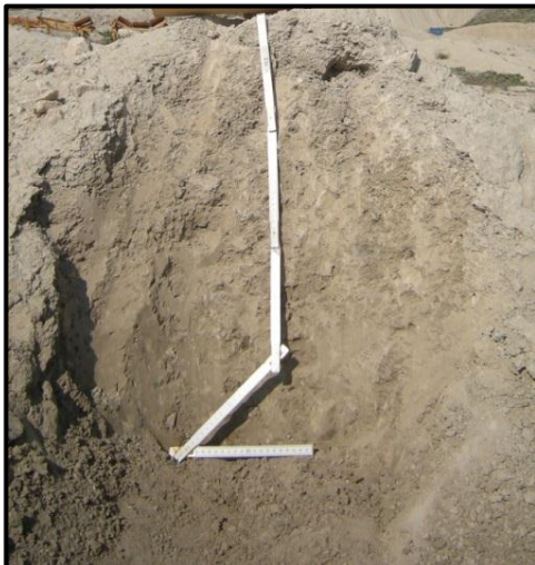
Figure 5. Mullock profile [14]