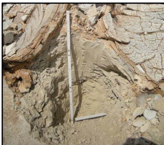
Figure 7. Ash profile [14]