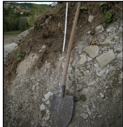
Figure 6. Soils of dumps in the process of recultivation [14]