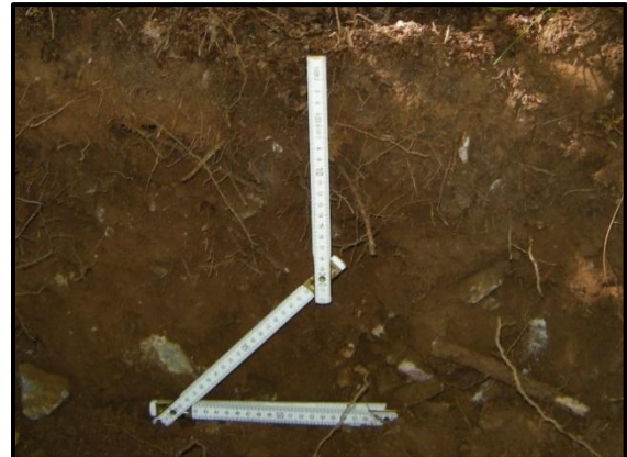
Figure 4. Soil profile [14]