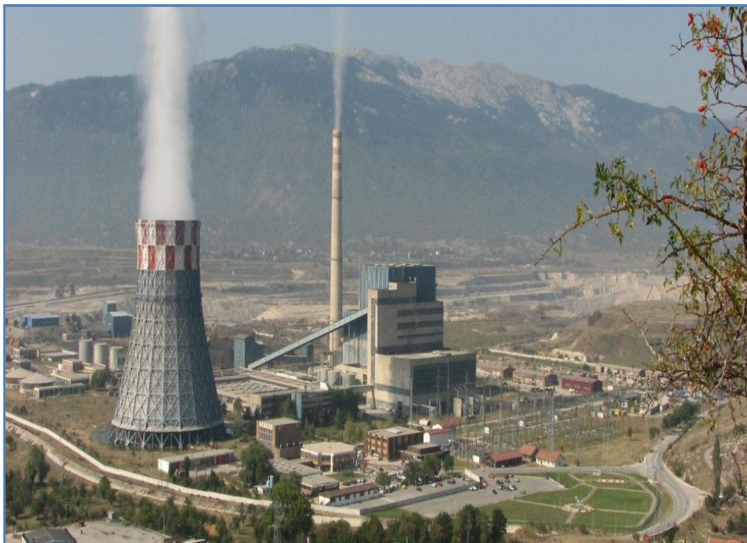
Figure 1. Thermal Power Plant Gacko [8]

The content of radionuclides of the soil was examined at Gacko area, slag, ash and mullock dumps in the thermal power plant Gacko and soils of dumps in the process of re-cultivation. The gamma-spectrometric measurements were done in the Institute of Nuclear Sciences “Vinča” in Belgrade.