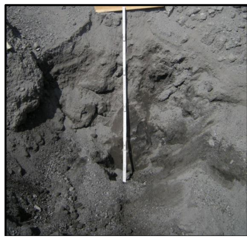
Figure 8. Slag profile [14]