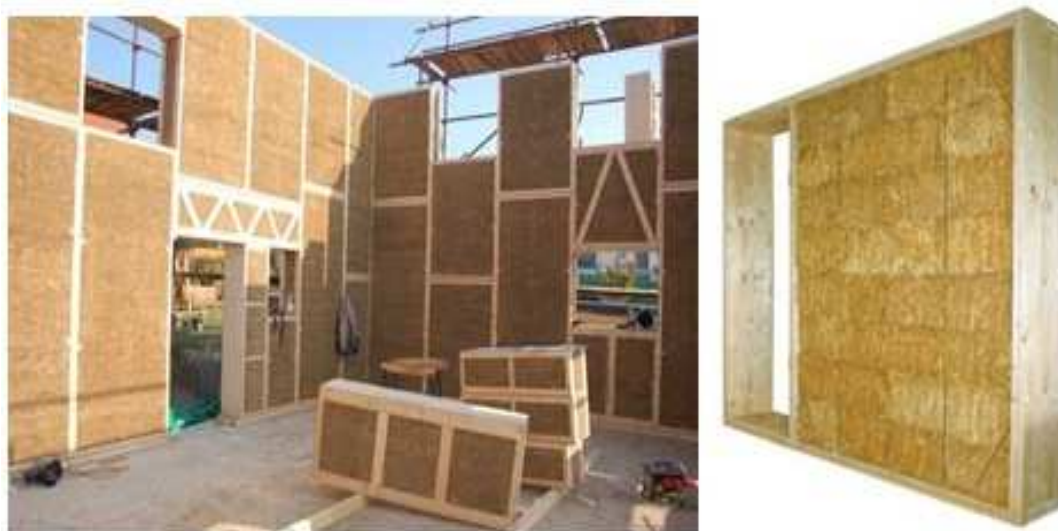
Figure 4. Ecococon panels

Precast panels , the next logical step in the development of traditional materials in a modern building and adapting modern technologies of construction. This is the development of modular panels with a wooden framed structure, where it is possible to build smaller buildings up to two floors, in Figure 4, [4,5,6].