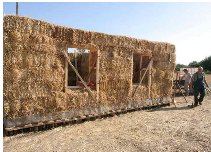
Figure 3. The house built by Lehel Horvat, Serbia

Individual straw bale construction , the method of construction, resulting from a traditional manual construction where, thanks to the use of mechanization in agriculture bale of straw blocks appear as suitable for construction, in Figure 3.