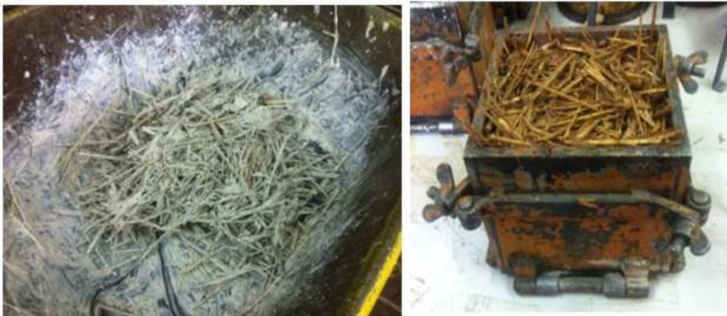
Figure 1. Mixing and filling in the molds

Preparation of samples started with sinking of the straw in water for 20 minutes, then it drained and mixed with the clay, and additional water enough to achieve a uniform mass - Figure 1 (left). Then the molds were filled with a mixture and compacted as in Figure 1(right) it is showed. The molds were then placed for drying.